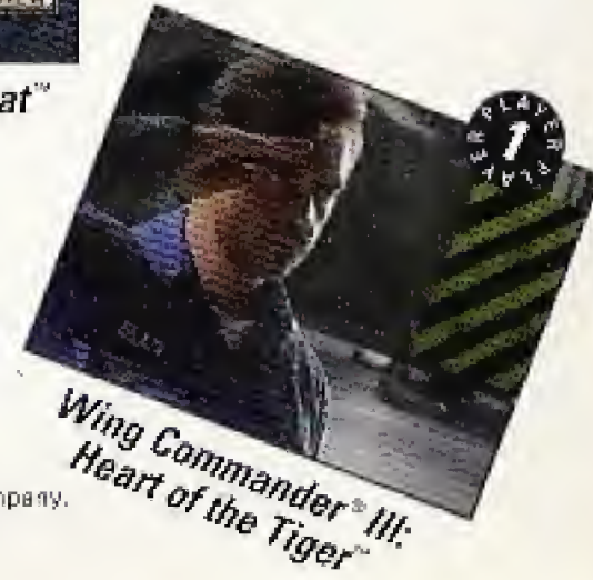
Wing Commander® III: Heart of the Tiger™